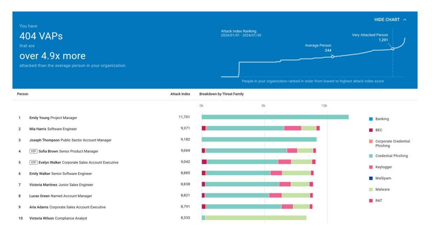
Figure 2. Proofpoint provides people-risk visibility into your Very Attacked People™ (VAPs).

Proofpoint helps you further mitigate your people risk by changing unsafe behaviour and building sustainable security habits. We use our rich threat intelligence to inform your programme in various ways. These include designing real-world phishing simulations, enabling threat-guided training that allows you to educate your top clickers and most attacked, and automating threat investigation of user-reported email. We help you keep users engaged by providing you with personalised learning experiences. Our adaptive approach helps your people retain what they learn and cultivate positive and lasting security habits. And we allow you to better communicate your people risk and programme impact to your leadership team by tracking real-world behaviour change and benchmarking it against your industry peers.