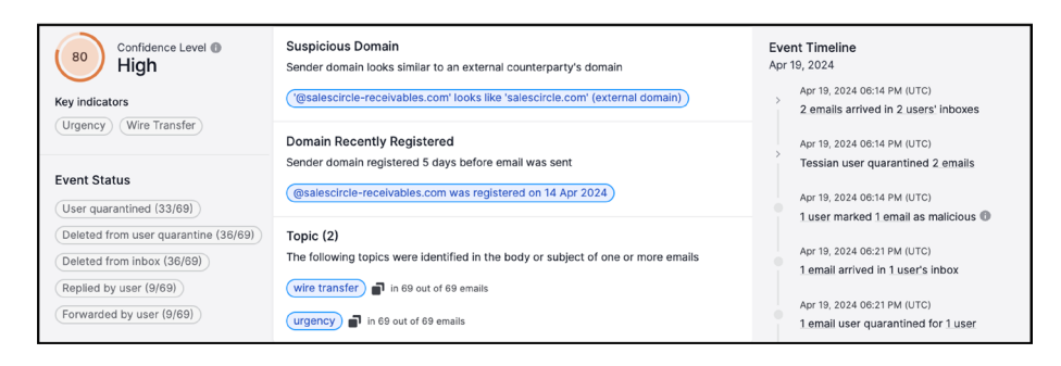
Figure 1: Adaptive Email Security automatically stops high-risk threats with behavioural Al.

Adaptive Email Security augments Proofpoint's core email security with Al-based behavioural and content analysis. It leverages integrated threat intelligence from more than 2.8 trillion emails a year. It uses deep learning, LLMs, NLP and more to check over 250 data points in every email. It also identifies internal phishing through anomalous email volume and communications when compared with historical email patterns.