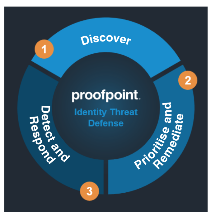
Figure 2: Proofpoint Identity Threat Defense platform.

Proofpoint research shows that 1 in 6 enterprise endpoints, both clients and servers, contain identity vulnerabilities. And this is even when traditional identity and access management (IAM) solutions are in place. Attackers exploit these vulnerabilities to gain access to admin privileges. When they first land on a host, that host is rarely their end target. They seek to move laterally